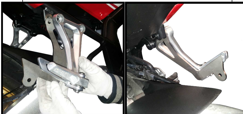
Fissaggio staffa 50.SS.873.1 Fitting bracket 50.SS.873.1